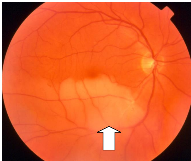
Figure 2. Eye with BRAO

Typically an affected patient has sudden, painless loss of vision in one eye, which brings him to the ophthalmologist. The pupils are dilated and the occlusion can be recognized as a pale area of the retina. Sometimes the particle blocking the artery is visible. Figure 2 illustrates such a situation.